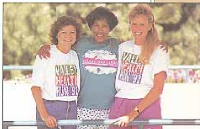
Many Valley employees are active in community outreach programs.

Crisis intervention services for patients and families are provided 24 hours a day by the Emergency Room Intervention Team (ERIT) social workers and counselors in the Emergency Department. Some services are offered at no charge to ER patients and families, and may include consultation, counseling and social services.